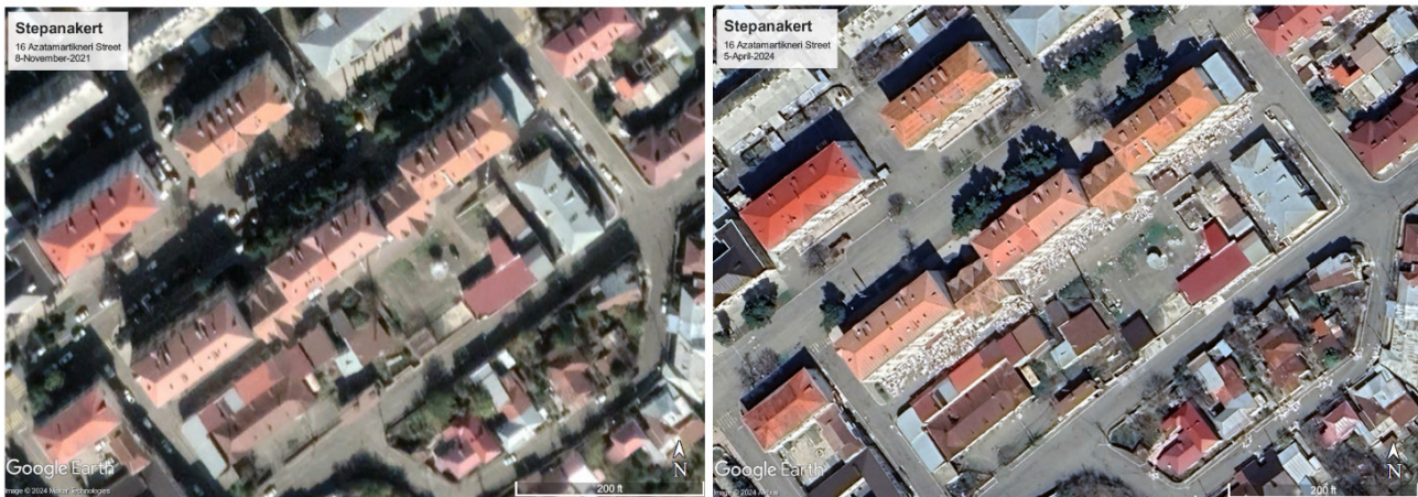
Figure 5. Belongings in Stepanakert apartments are thrown outside.