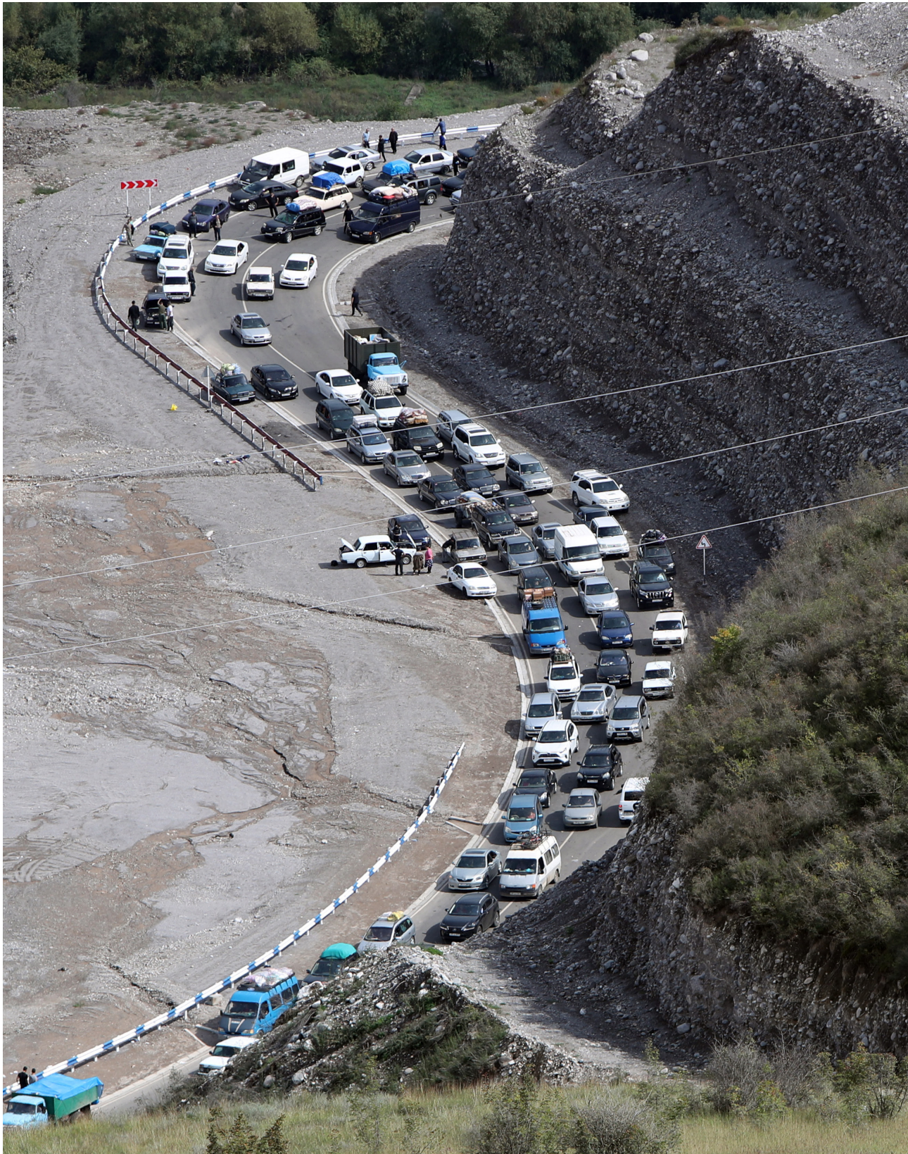
Traffic congestion on the Lachin Corridor in September 2023.