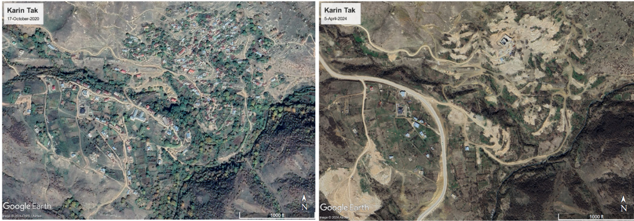
Figure 3. Karin Tak village before and after its demolition.