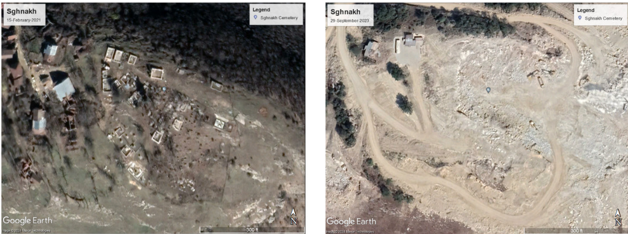
Figure 4. Sghnakh Cemetery before and after the demolition.