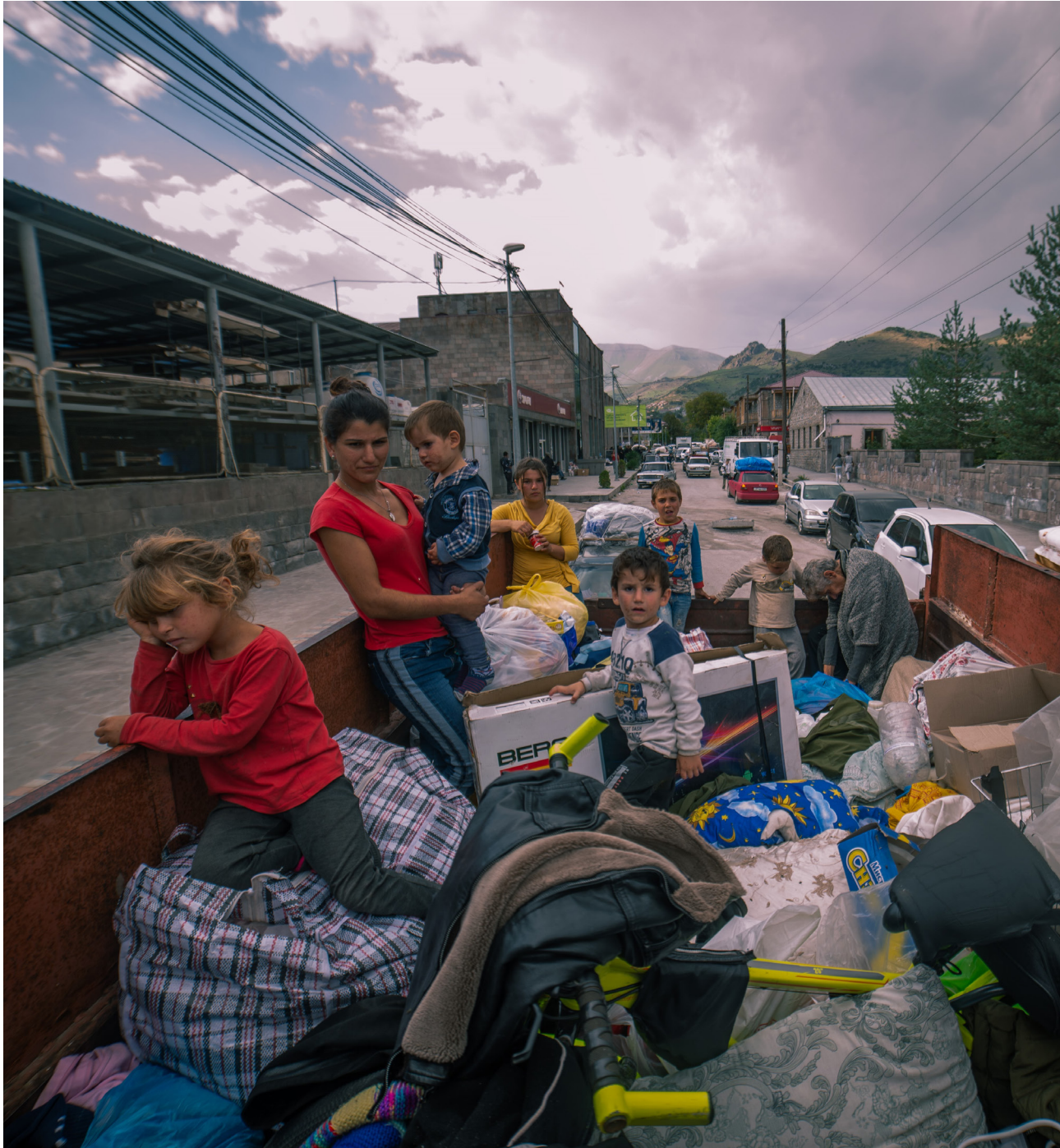
Displaced people from Nagorno-Karabakh in Goris, Armenia (Photo © Avet Avetisyan, September 2023).